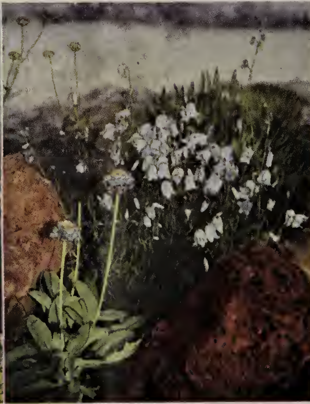
Primula and Campanula Rotundifolia.